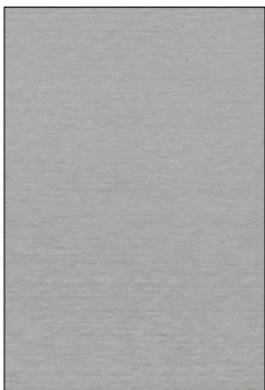
SURFACE & EDGE Satin Stainless