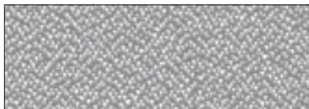
MAIN FABRIC OPS Cinder